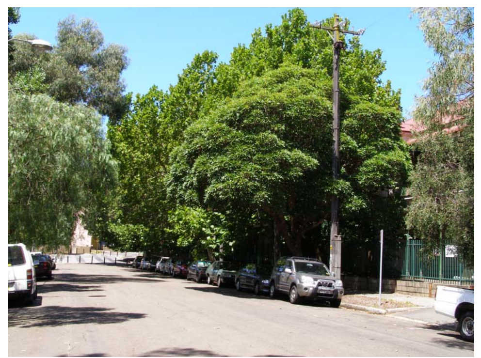
Photograph 6: Illustrating street trees in Wilson Street adjacent to the eastern end of the site.