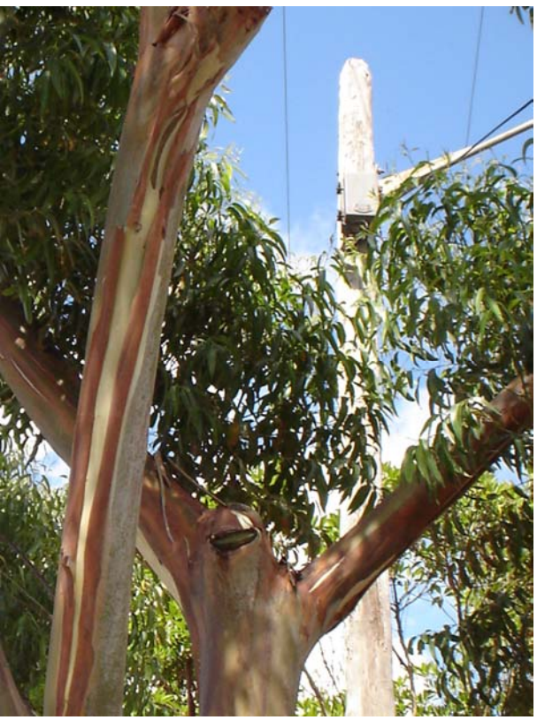
Photograph 2: Illustrating the severe pruning (removal of central leaders) of many trees plated under electricity wires on the Wilson Street frontage of the site.