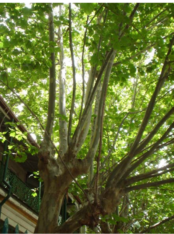
Photograph 4: Illustrating the severe past pruning (pollarding) and subsequent poorly attached regrowth in tree numbers 228 to 235.