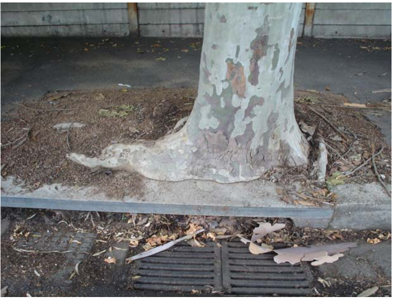
Photograph 1: Illustrating the conflicts between trees and infrastructure in a number of trees on the Wilson Street frontage of the site.