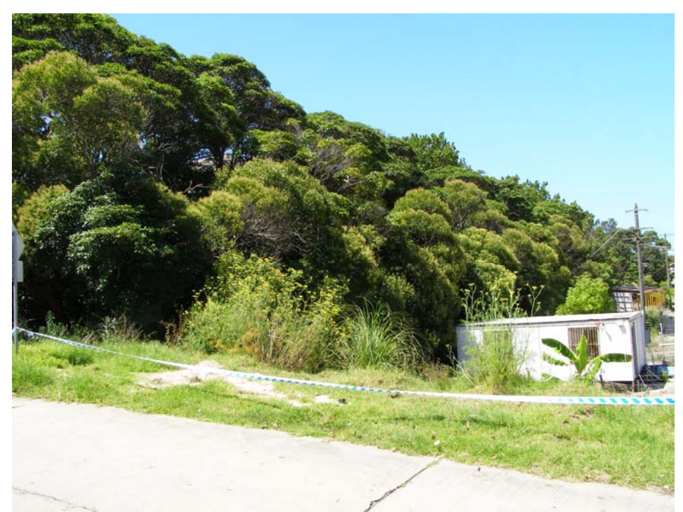
Photograph 5: Illustrating the vegetation on the embankment adjacent to the Wilson Street boundary towards the western end on the site.